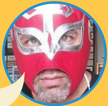
BOSS DUDE AT DEATH RAY RECORDS

"I have a stage on the curb outside the shop during Newtown Festival. It's rad. Really looking forward to seeing local D-Beat punk band, Rogernomix perform. Auckland's garage trash band The Bloodbags, droney noise eggs Church of Goya, acid psych babes Linen, kraut party gents the Spectre Collective and not on my stage Womb! Also forgot to mention Tidal Rave, Mermaidens, O-Boy, Totems and a whole lot more. So much more!!!"